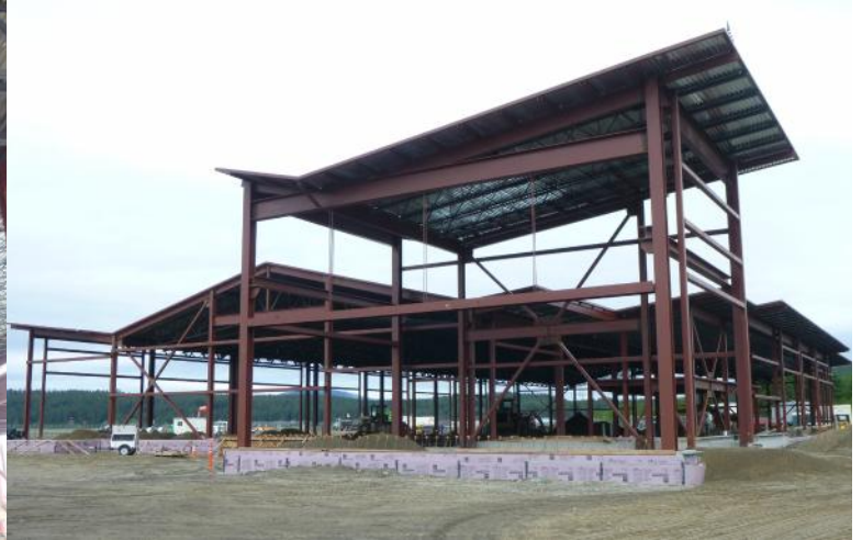
View of SREB steel frame looking West. Maintenance Bay in foreground.