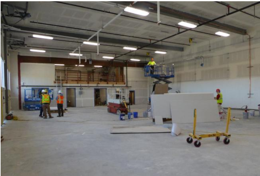
ARFF Apparatus Bays interior view, as finishes are being installed.