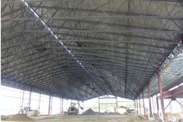
SREB Interior view, looking east through the equipment parking area.