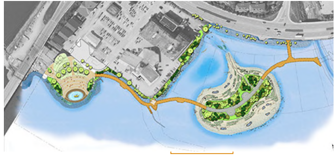
Bridge to Gold Creek, current project (2016 - 2017)