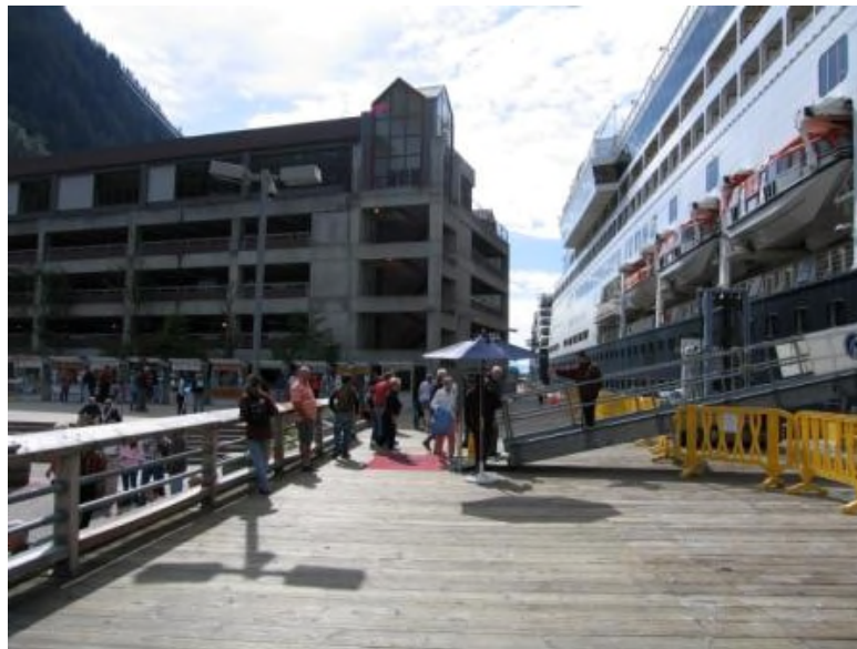
Port Field Office open May 1 to September 30th Hours 8:00 am to 4:30 pm closed 12:00 to 1:00 for lunch