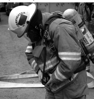
Capital City Fire And Rescue