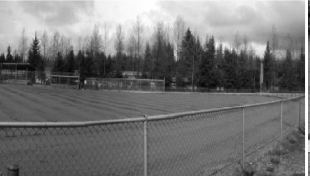
Miller Field Resurfacing