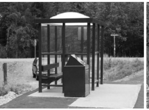
Montana Creek Bus Shelter