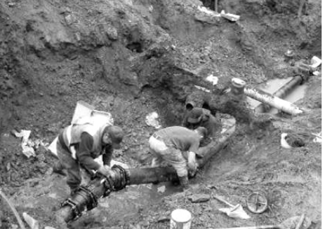
2nd Street Douglas